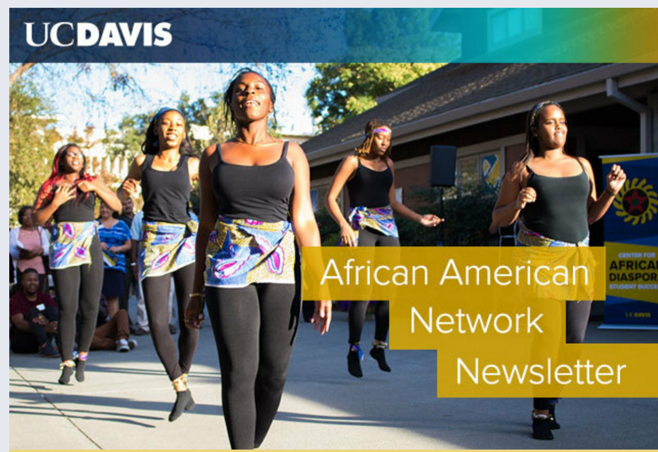
Students perform at the opening of the UC Davis Center for African Diaspora Student Success, a space for African and African American students to pursue academic, social and career opportunities.